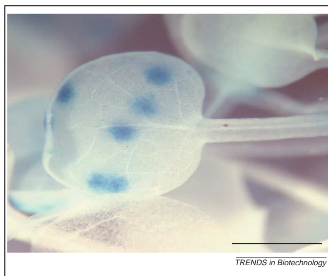
Figure 2. Synthetic pathogen-inducible promoters direct local gene expression at infection sites. A transgenic Arabidopsis seedling containing the synthetic promoter 4×S driving the E. coli uidA reporter gene that leads to the expression of \beta -glucuronidase enzyme activity. Leaves were inoculated with the downy mildew Peronospora parasitica pv Cala2 . The promoter directs high-level local expression at infection sites that is visible as a blue colouration. Scale bar = 3 mm.

An encouraging and perhaps unexpected finding from this work on synthetic promoters was that defence signalling could be well conserved across species